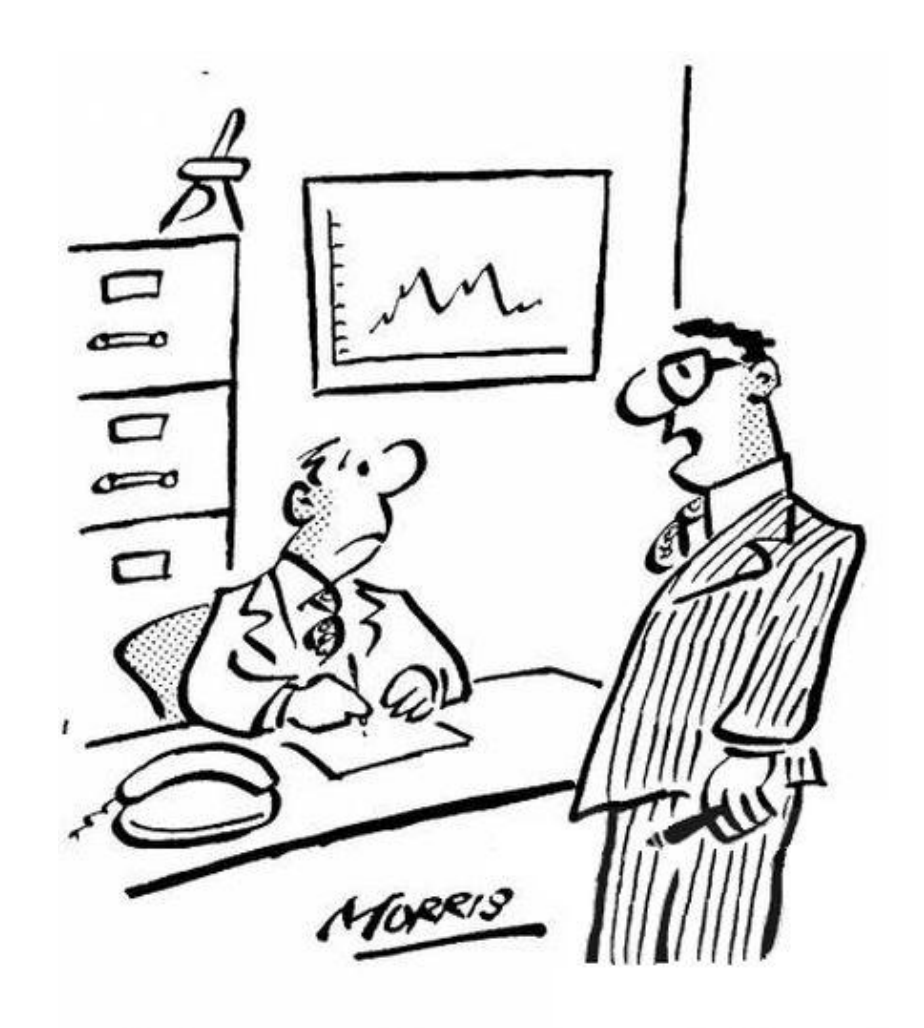
"By the way, while you were off sick we located the bottle neck."